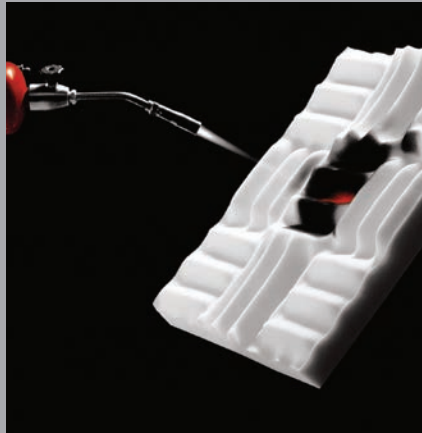
willtec meets ASTM E-84 Class 1 fire rating