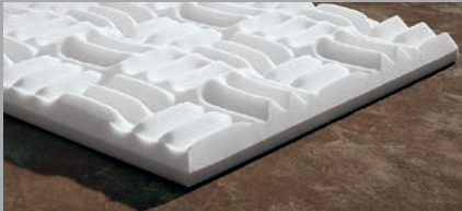
SONEX One Panel