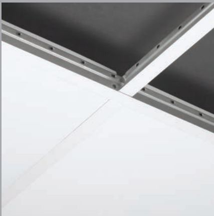
SONEX Clean Ceiling Tiles