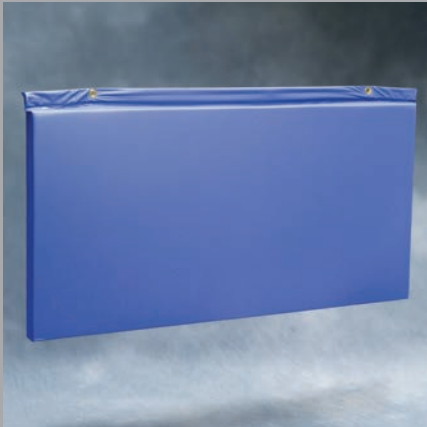
SONEX Clean Baffles