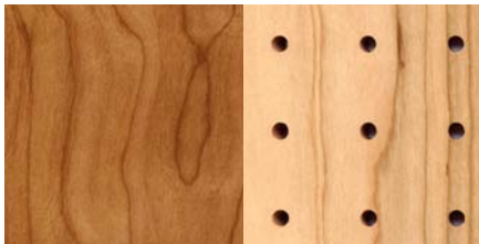
Cherry - Red and Natural