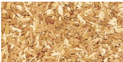
Light, Medium and Dark (Medium shown)