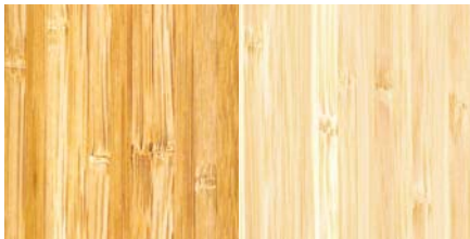
Bamboo - Caramel and Natural