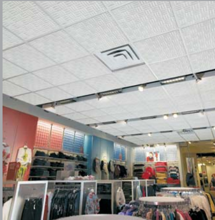
White ceiling grid system supporting HARMONI Ceiling Tiles