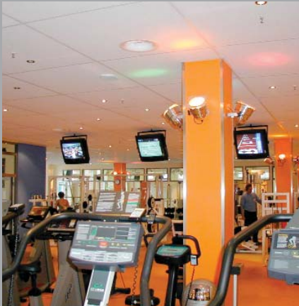
White ceiling grid system supporting WHITELINE® Ceiling Tiles