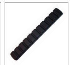
Self-stick supplemental headband cushion