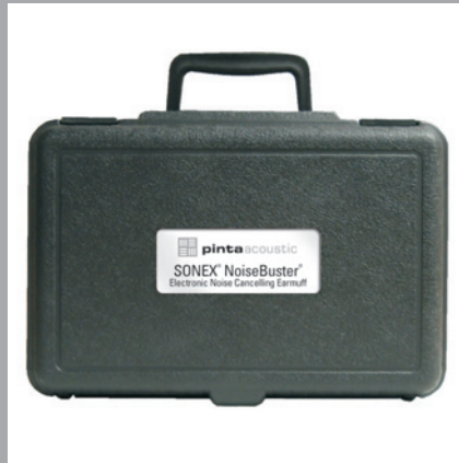
Carrying case with foam insert