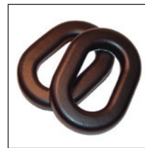
Replacement ear cushions