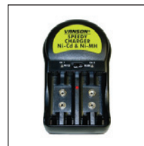
Speedy battery charger