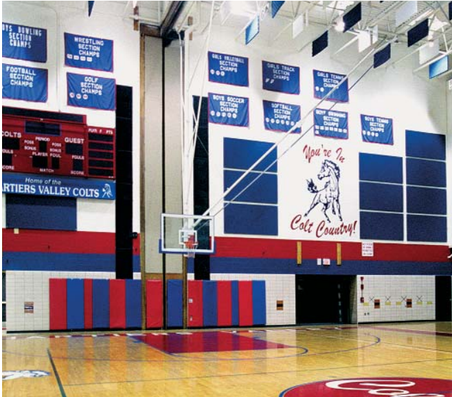
Product: FABRITEC Panels and SONEX® Baffles Application: High school gym