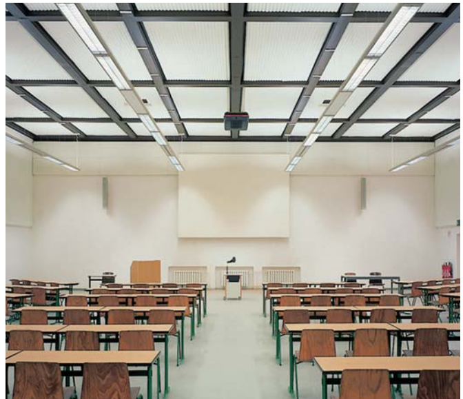
Product: WHITELINE® Ceiling Tiles Application: Lecture Hall

To learn more about these and other applications, visit our website at www.pinta-acoustic.com/edu .