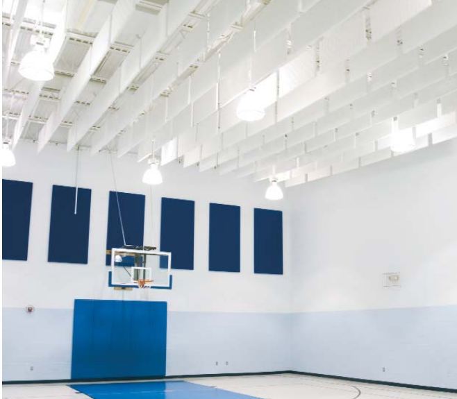
Product: SONEX® Baffles Application: Gymnasium