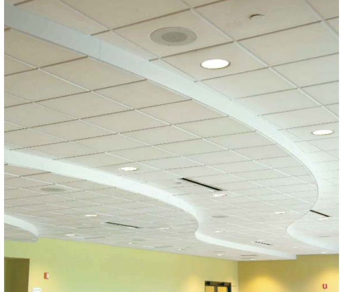
Product: CONTOUR® Ceiling Tiles Application: Cafeteria Architect: Turok Architecture, Inc.