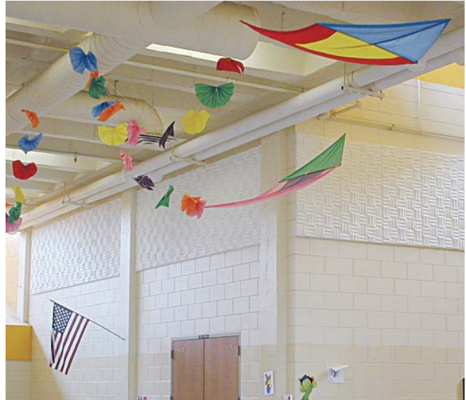
Product: SONEX Panels Application: Elementary school multipurpose room and cafeteria