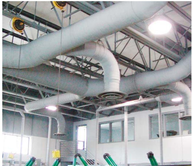
Product: WHITELINE® Ceiling Tiles Application: Technical college classroom

To learn more about these and other applications, visit our website at www.pinta-acoustic.com/edu .