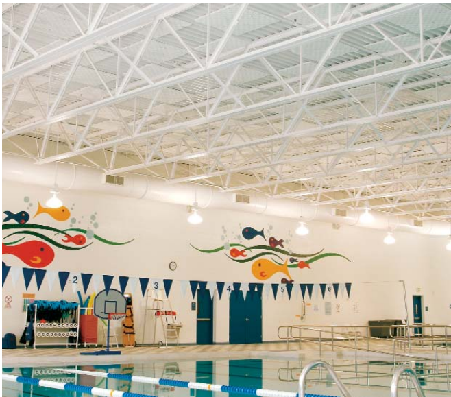
Product: SONEX Panels Application: Indoor pool