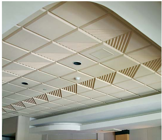
Product: CONTOUR Ceiling Tiles Application: Dining room

To learn more about these and other applications, visit our website at www.pinta-acoustic.com/ent .