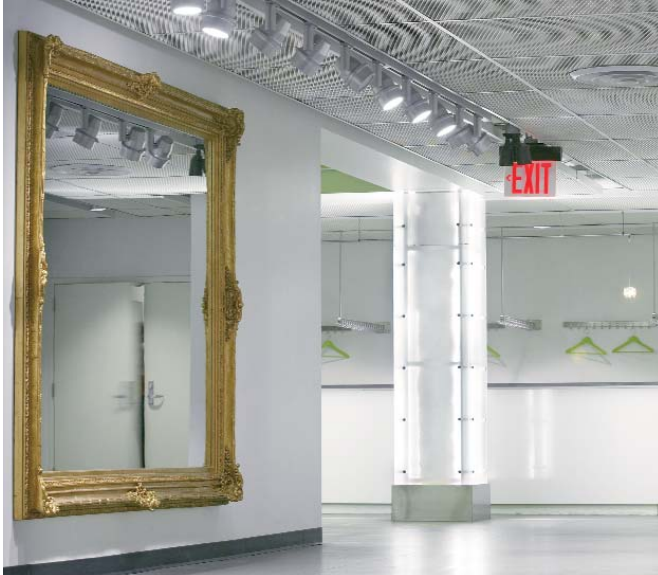
Product: SQUARELINE® Metal Ceiling Tiles Application: Theater performing arts Architect: Beyer Blinder Belle Architects and Planners, LLP