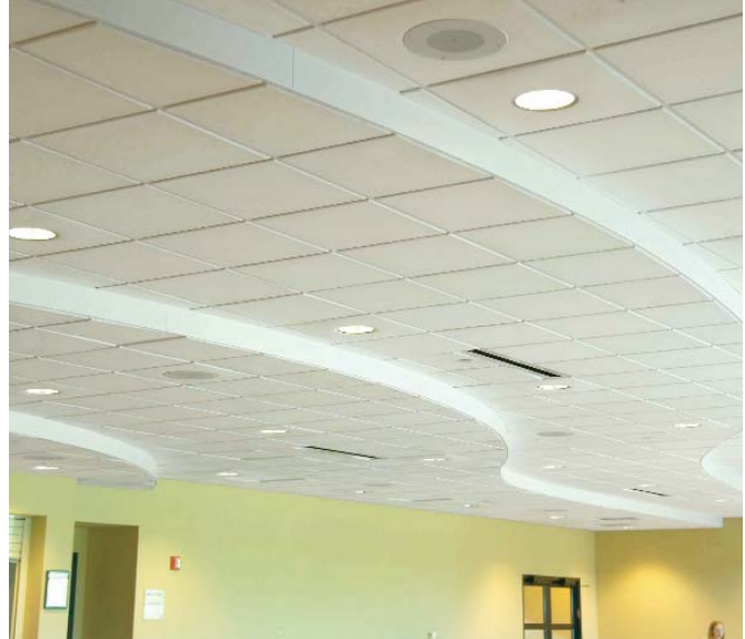
Product: CONTOUR® Ceiling Tiles Application: Cafeteria Architect: Turok Architecture, Inc.