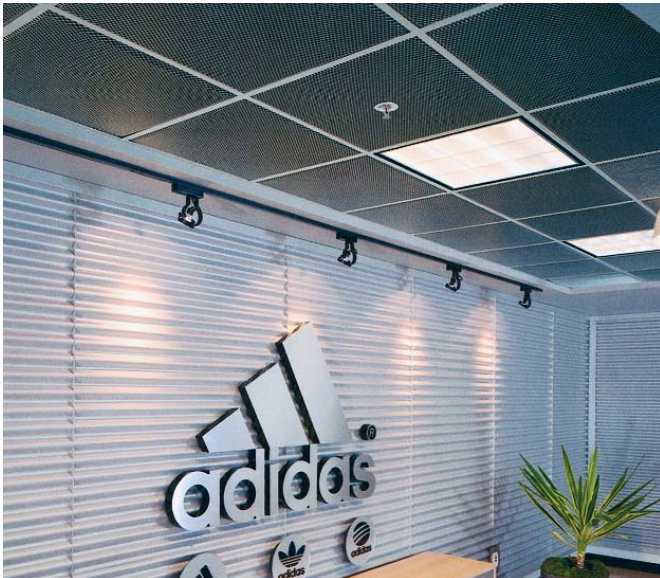
Product: SQUARELINE® Metal Ceiling Tiles Application: adidas Village lobby and entrance Architect: LRS Architects