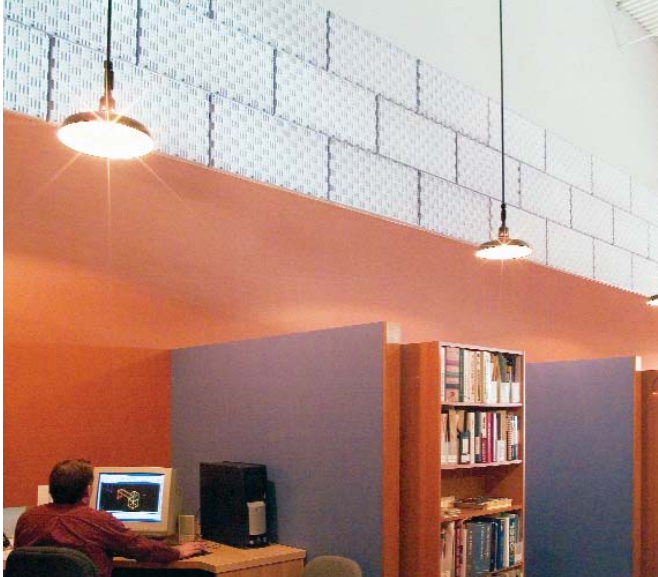
Product: SONEX® Panels Application: Office