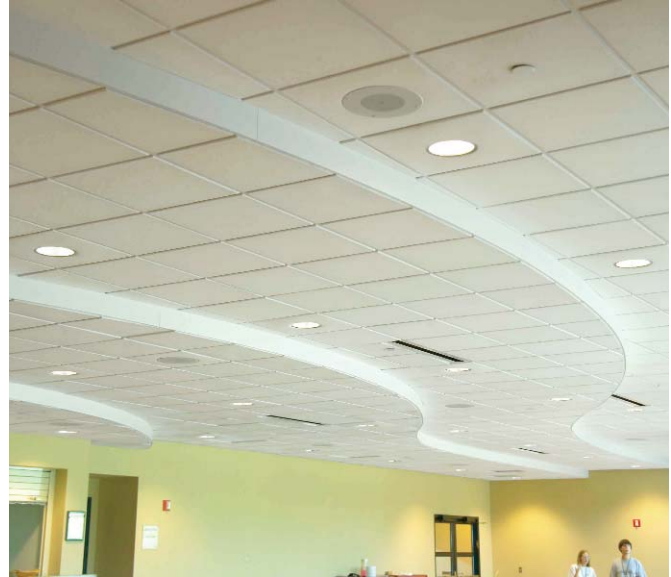
Product: CONTOUR® Ceiling Tiles Application: Cafeteria Architect: Turok Architecture, Inc.