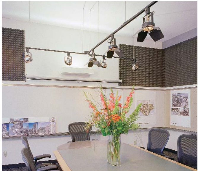
Product: SONEX® Pyramid Panels Application: Conference room in architectural firm Architect: Hewitt Architects of Seattle