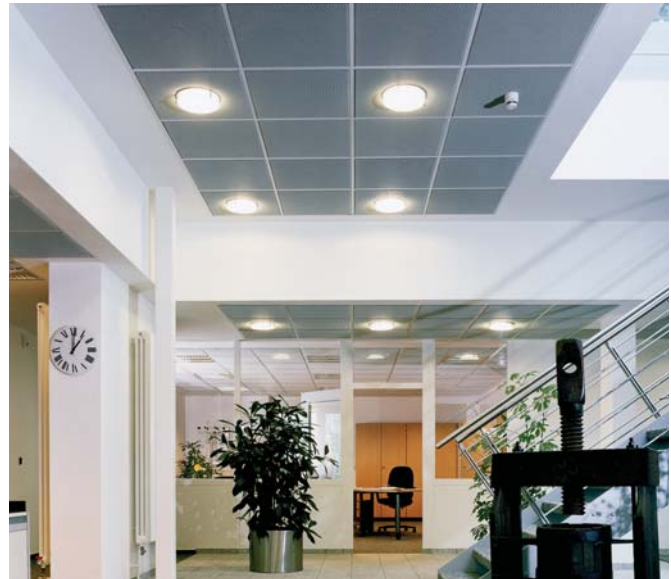
Product: SQUARELINE Metal Ceiling Tiles Application: Lobby

To learn more about these and other applications, visit our website at www.pinta-acoustic.com/office .