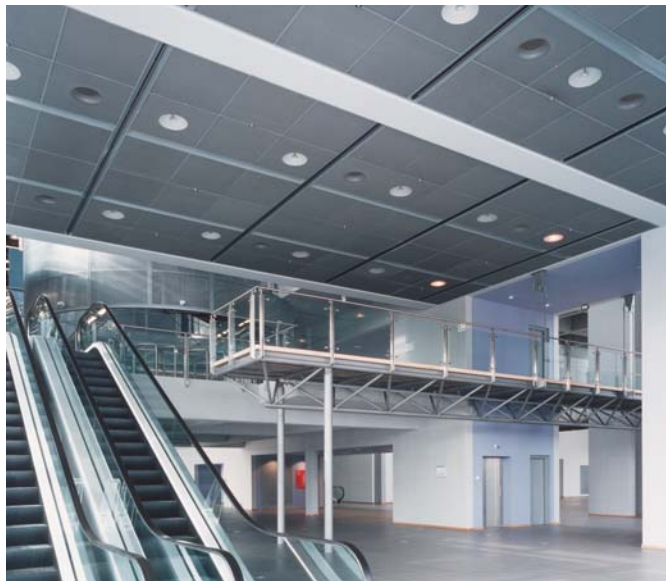
Product: SQUARELINE Metal Ceiling Tiles Application: Building lobby and entrance

To learn more about these and other applications, visit our website at www.pinta-acoustic.com/office .