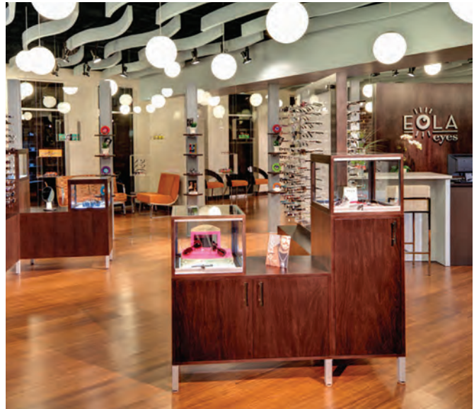
Product: WHISPERWAVE™ Baffles Application: Retail Architect: Studio 3 Designs