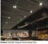
Project: LINDSAY - Major Living Area Application: Lounge Acoustic Solution: Sound reinforcement