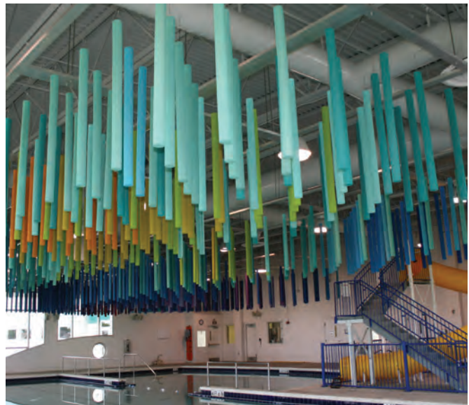
Product: SONEX® Rondo Baffles Application: Indoor Swimming Pool Artist: Xavier Cortada

To learn more about these and other applications, visit our website at www.pinta-acoustic.com/ent .