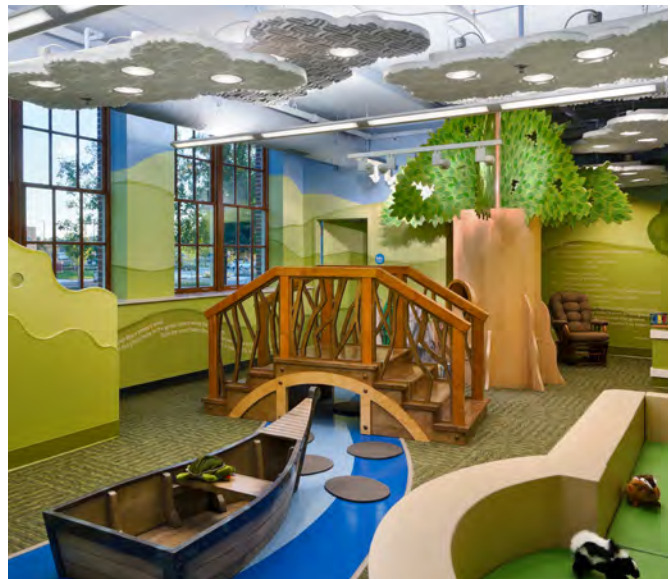
Product: SONEX® Panels Application: Children's Museum Gallery Architect: Architecture Incorporated

To learn more about these and other applications, visit our website at www.pinta-acoustic.com/ent .