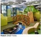
Project: LINDSAY - Major Living Area Application: Restaurant/Bar Acoustic Solution: Sound reinforcement

© 2013 Pinsa Acoustics. All rights reserved. For more information, visit us at www.pinsa.com