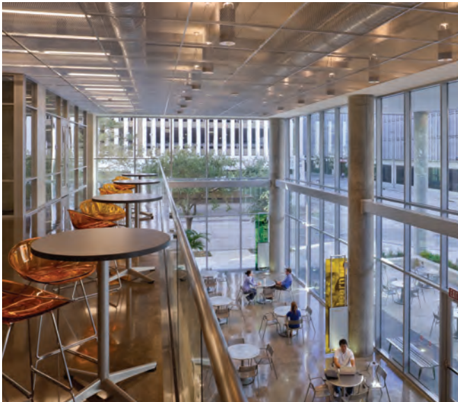
Product: SQUARELINE® Metal Ceiling Tiles Application: Fitness Facility Architect: Kirksey Architecture