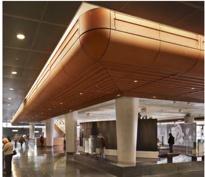
Product: SQUARELINE Metal Ceiling Tiles Application: Museum Gallery Architect: Ennead architects