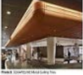
Project: SYDNEY - Major Living Area Application: Restaurant/Bar Acoustic Solution: Sound reinforcement