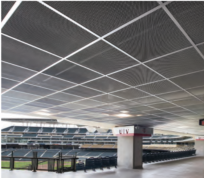
Product: SQUARELINE® Metal Ceiling Tiles Application: Stadium Architect: Hammel, Green and Abrahamson