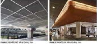
Project: LINDSAY - Major Living Area Application: Lounge Acoustic Solution: Sound reinforcement